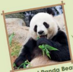
The Giant Panda Bear