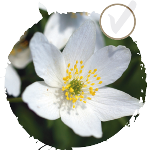
Wood anemone See it: March–May