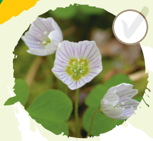
Wood sorrel See it: April–May