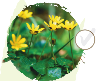
Lesser celandine See it: March–May