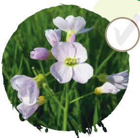
Cuckooflower See it: April–June