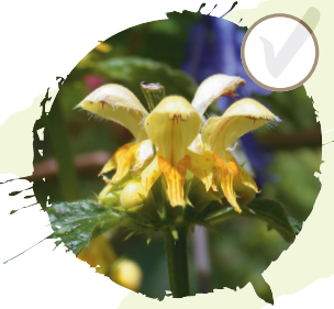
Yellow archangel See it: May–June