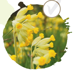
Cowslip See it: April–May