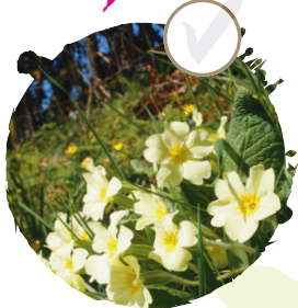
Primrose See it: December–May