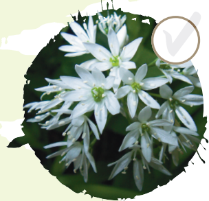
Ramsons (wild garlic) See it: April–May