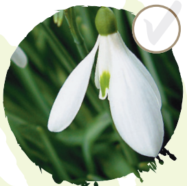
Snowdrop See it: January–March