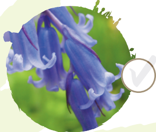
Bluebell See it: April–May