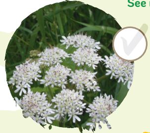
Cow parsley See it: May–June