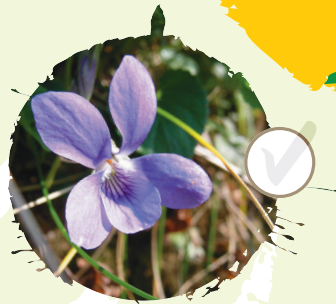
Common dog violet See it: April–June