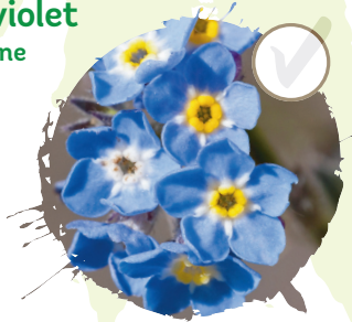
Wood forget-me-not See it: April–June

Look out for flowers in woodland, gardens and by the roadside.