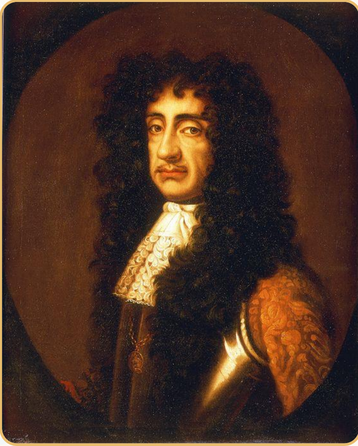
Photo courtesy of lisby1(flickr.com) - - granted under creative commons licence - attribution